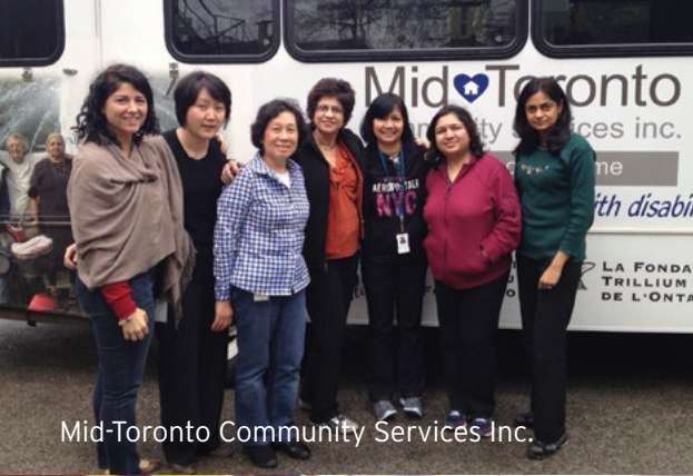
Mid-Toronto Community Services Inc.