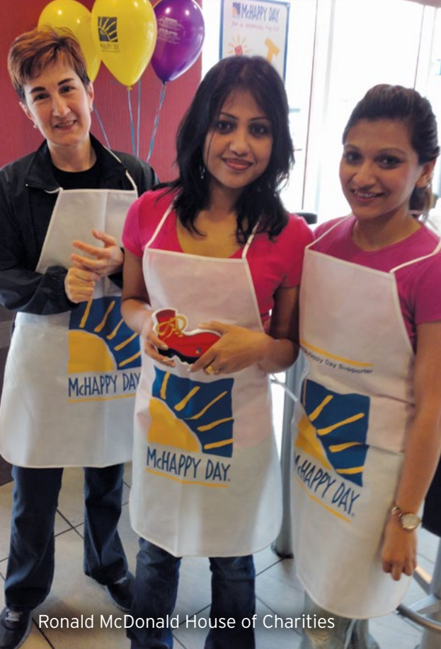
Ronald McDonald House of Charities