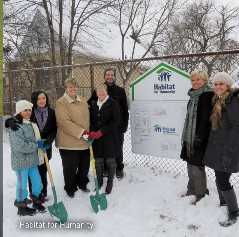
Habitat for Humanity