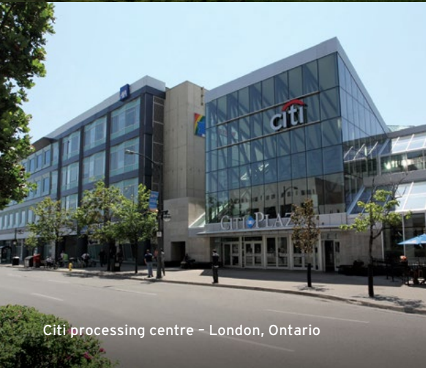
Citi processing centre - London, Ontario