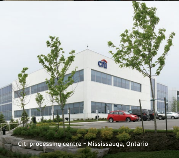
Citi processing centre - Mississauga, Ontario