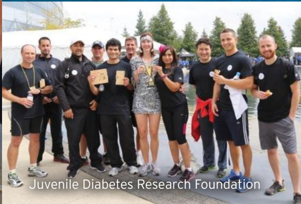
Juvenile Diabetes Research Foundation