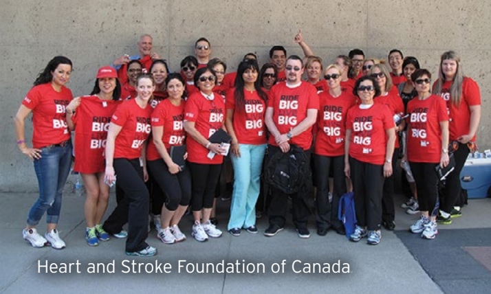
Heart and Stroke Foundation of Canada