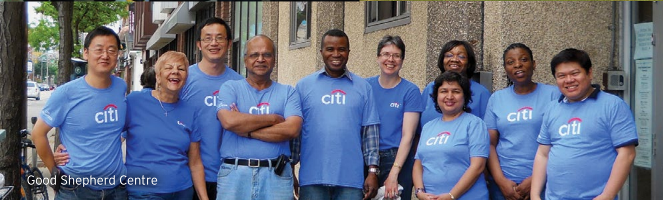
Good Shepherd Centre