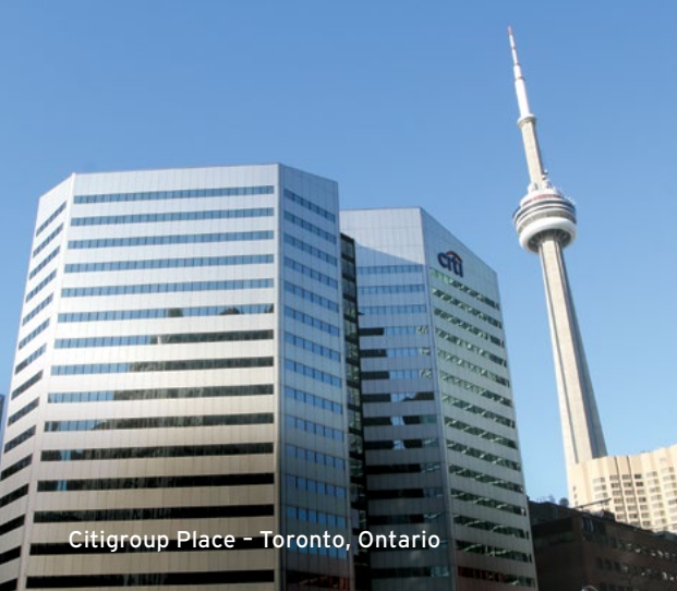
Citigroup Place - Toronto, Ontario