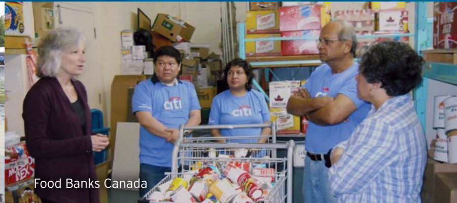
Food Banks Canada