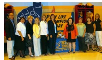
Citi enhanced the second annual back-to-school event at Bryan Hill Elementary in St. Louis, MO this year by inviting community partners to participate in the celebration. Gathered are representatives from Citi, Bryan Hill Elementary, Junior Achievement, the Shakespeare Festival, and KidSmart.

In Our Communities. In St. Louis, MO , Citi helped provide a motivational "welcome back" for children in Bryan Hill Elementary School. We provided posters with the "Play Like a Champion" slogan, to be displayed around the school, and "champion" profiles of African-American heroes. In addition, Citi's St. Louis site coordinated a school supply fundraising drive and, through our St. Louis partner KidSmart, we donated many supplies for the students and teachers at Bryan Hill.