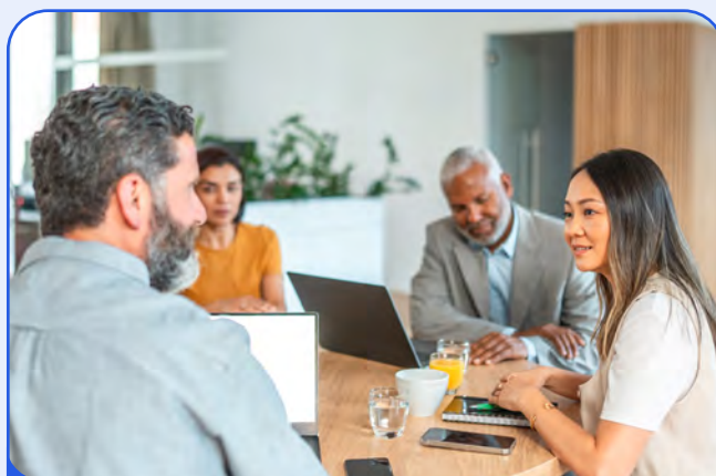
A learning community

“Since the initiative’s inception, Urban Institute has collaborated with Community Progress Makers grantees to enhance opportunities for every person and community. These organizations are powerful catalysts for change, and we are committed to supporting them with data-driven insights that foster