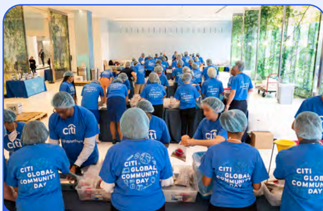
Global Community Day