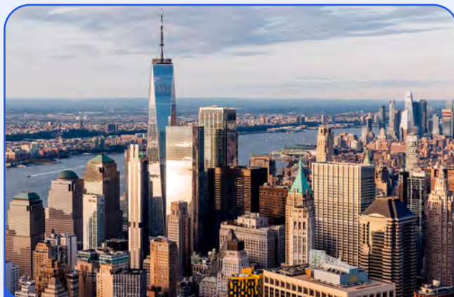
Expanding reach: leveraging Citi platforms